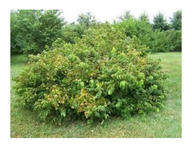
15: Hazelnuts (nut)