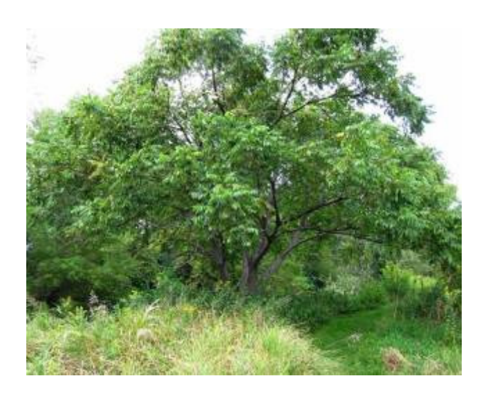
14: White Walnuts (nut)