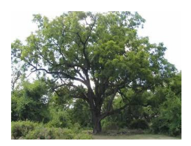
13: Black Walnuts (nut)