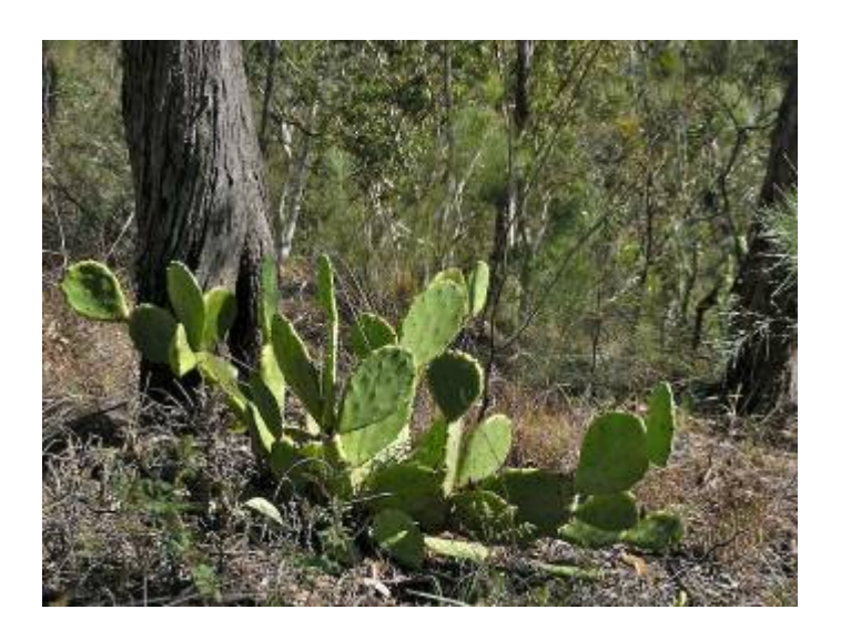
9: Prickly Pear (fruit)

The Prickly Pear plant ( Opuntia spp. ) is a green, leafy, flowering cactus that is most abundant in the Southwestern region of North America and is easy very to identify. Also, its fruits are high in sugars which the human body converts to carbohydrates for use as a quick fuel source.