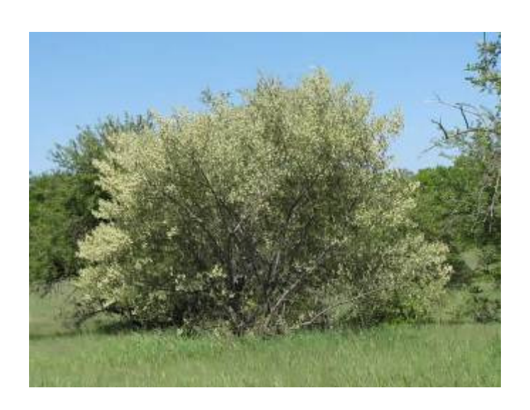
10: Autumn-olive (berry)

The Autumn-Olive plant (Elaeagnaceae umbellata) is a green, woody, flowering, deciduous, shrub that is endemic to China but which is abundant throughout the U.S. and Canada and it is very easy to identify. Also, its fruits are high in sugars which the human body converts to carbohydrates for use as a quick fuel source.