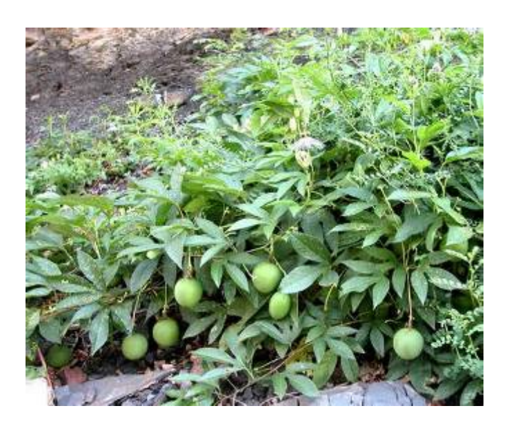
7: Maypop (fruit)

The Maypop plant ( Passiflora incarnata ) is a green, leafy, flowering, vine that is most abundant in the Southeastern region of North America and is easy to identify. Also, its fruits are high in sugars which the human body converts to carbohydrates for use as a quick fuel source.