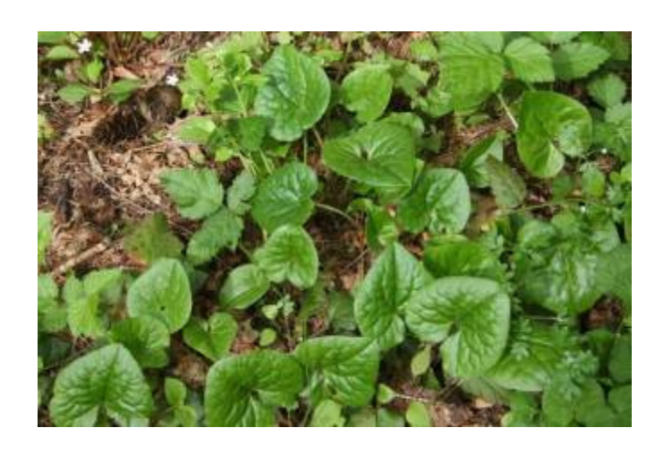
23: Wild Ginger (nausea & vomiting)

Wild Ginger root ( Asarum canadense ) is a well known and widely accepted natural remedy that has been used for thousands of years for relieving nausea and vomiting. The roots of this plant contain the antihumor aristolochic acid and thus, it has also use by many Native American tribes as a remedy for indigestion, cramps, sore throats, coughs, colds, and nervous conditions.