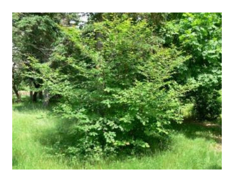
26: Witch Hazel (astringent)

Witch Hazel ( Hamamelis virginiana ) is an astringent, hemostatic, and antioxidant and has historically been one of the most important American medicinal plants and is still so today. Due to the tannins contained in the leaves and bark of this plant, the leaves are usually prepared as a poultice and applied externally to treat abrasions and minor cuts, as a tisane or a tincture and applied externally to relieve itching, skin irritations, and minor pain as well as hemorrhoids, and as a tisane ingested internally to treat sore throat, fevers, and colds.