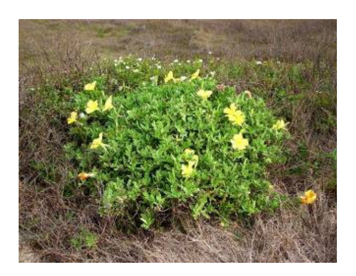
19: Evening Primrose (minerals K, Mg, & Fe)