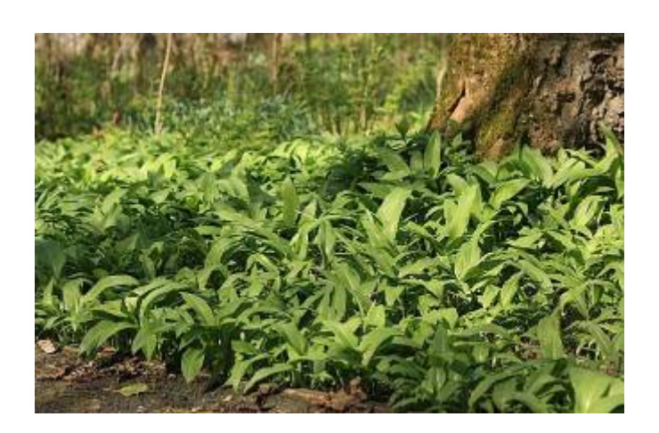
20: Wild Garlic (antiseptic/antibiotic)

The root bulbs of Wild Garlic plant ( Allium vineale ) contain both a powerful antiseptic and an antibiotic compound. Therefore, the bulbs are usually crushed and applied externally for cleansing wounds. Also, they can be ingested orally for treatment of colds, sinus congestion, earaches, stomach aches, and headaches as well as for reducing fevers and coughs.