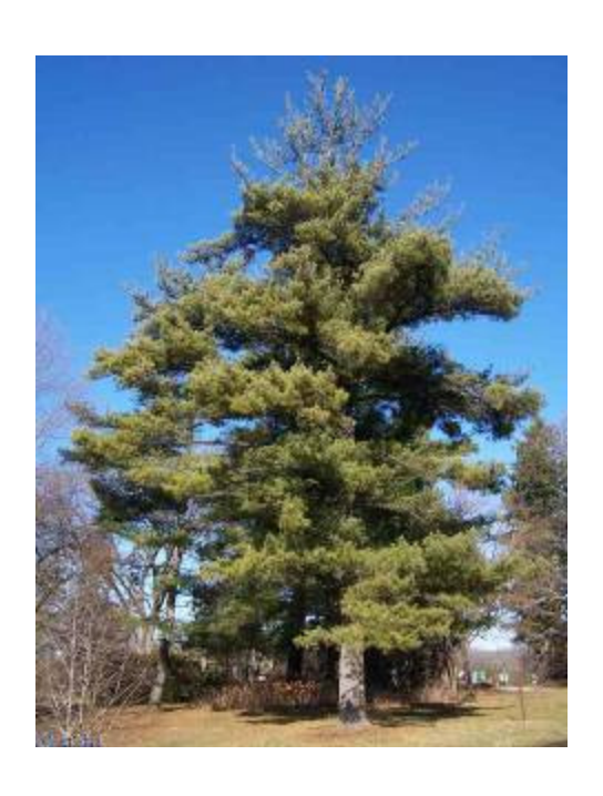
17: White Pine (vitamins A & C)