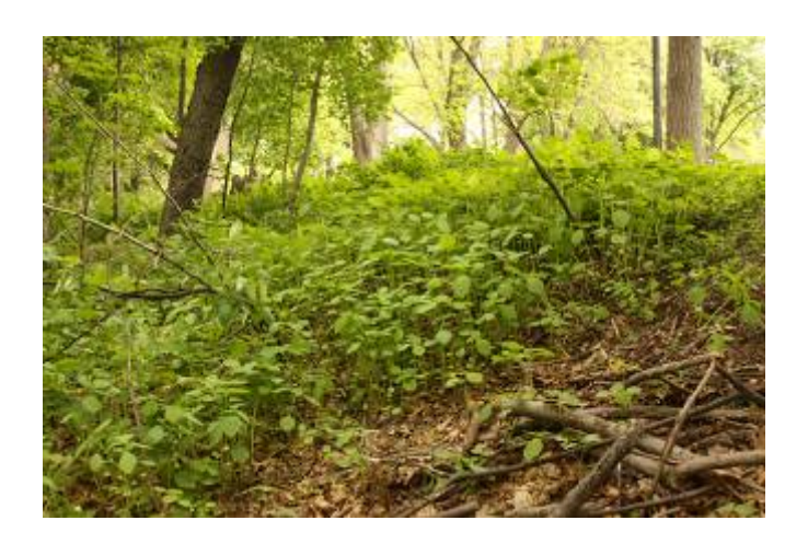
27: Jewel Weed (Poison Oak rash/antihistamine)

Jewelweed ( Impatiens capensis ) is a well known and widely accepted natural remedy for relieving the rash caused by contact with Poison Oak. Both the leaves and stems of the plant contain Lawsone which may explain its antihistamine and anti-inflammatory properties. Also used traditionally as a remedy for insect bites, sores, cuts, bruises, sprains, burns, eczema, and ringworm.