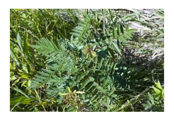
24: Wild Licorice (antacid)

Wild Licorice root ( Glycyrrhiza lepidota ) is a well known natural remedy for acid indigestion because it acts as a natural antacid. Also, it contains an antiviral compound, and is considered to be antiviral, anti-inflammatory, anti-convulsive, and antiallergenic. Therefore, it is also widely used for relieving sore throat, cough, diarrhea, stomach ache, ear ache, and for reducing fevers in children.