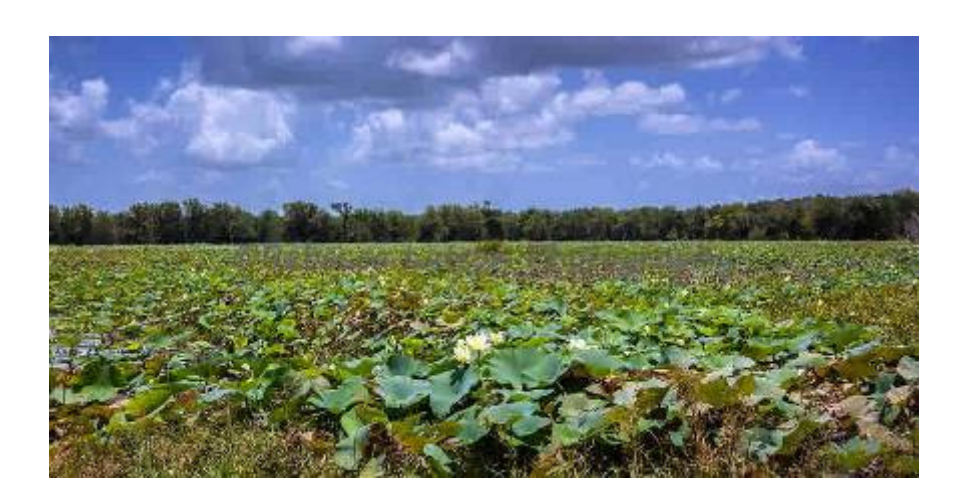
16: American Lotus (seed)