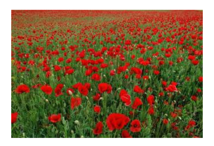
29: Opium Poppy (intense pain reliever)

The Opium Poppy ( Papavar somniferum ) produces a latex that is Nature's most potent and effective painkiller. Known as "the milk of the poppy", this plant has been used by Man since prehistoric times and by Asian, Indian, and European cultures for centuries for the relief of severe pain and to induce sleep. However, it should be noted that because this plant substance contains opioids, it should be used with caution and as infrequently as possible to avoid developing a dependency. Therefore, it is best reserved for emergency situations which require the relief of extreme pain.