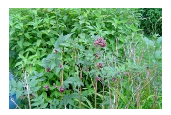
6: Hopniss (tuber)

The Hopniss plant ( Apios americana ) is a green, leafy, flowering vine that is abundant throughout eastern North America and is easy to identify. Also, its tubers are high in starches which the human body converts to carbohydrates.