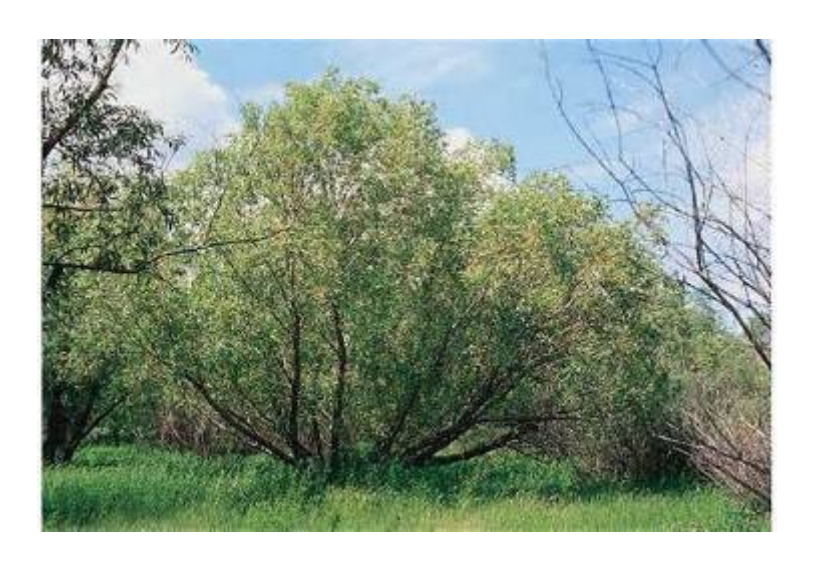
28: White Willow (mild pain reliever)

White Willow ( Salix alba ) bark is one of the most well known sources of Salicin which is oxidized in the human bloodstream and the liver to produce Salicylic Acid which is the natural form of aspirin. Therefore, it is used like aspirin to relieve minor pain caused by over exertion, minor injuries, headaches, and inflammation as well as to reduce fever and cure diarrhea.