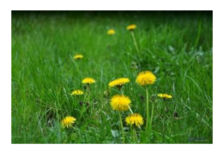
18: Dandelion (vitamins A, C, D, & B complex)