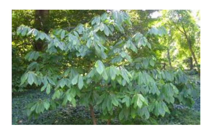
11: Common Pawpaw (fruit)