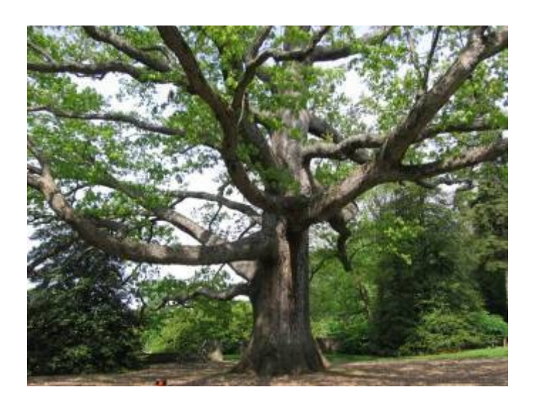
12: Acorns (nut)