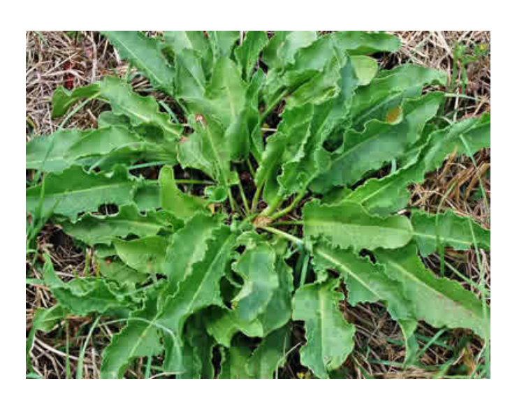
1: (Curly) Dock (leafy vegetable)

The Dock plant ( Rumex spp. ) is a green, leafy, flowering, weed that is abundant throughout North America and is easy to identify. Also, its greens are high in vitamins and minerals A, E, C, K, iron, magnesium, manganese, calcium, folic acid, carotenoids, and Omega 3 fatty acids. In ddition, they are high in fiber which helps to keep your digestive system working properly and, they contain antioxidants which help prevent cell damage and cell mutations.