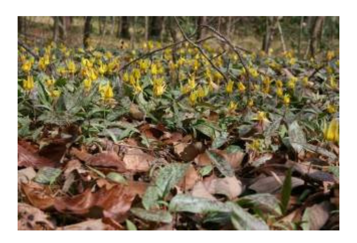
4: Trout Lily (bulb)

The Trout Lily plant ( Erythronium spp. ) is a green, leafy, flowering vine that is abundant throughout North America and is easy to identify. Also, its bulbs are high in both sugars or starches (depending on the time of year they are harvested) which the human body converts to carbohydrates.