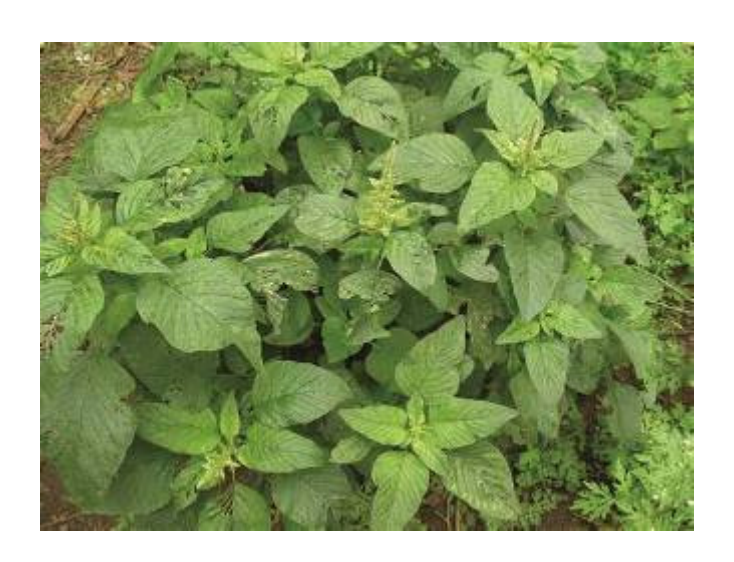
2: Amaranth (leafy vegetable)

The Amaranth plant ( Amaranthus spp. ) is a green, leafy, flowering, weed that is abundant throughout North America and is easy to identify. Also, its greens are high in vitamins and minerals A, E, C, K, iron, magnesium, manganese, calcium, folic acid, carotenoids, and Omega 3 fatty acids. In addition, they are high in fiber which helps to keep your digestive system working properly and, they contain antioxidants which help prevent cell damage and cell mutations.