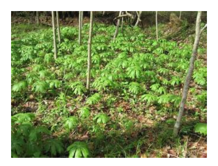
8: Mayapple (fruit)

The Mayapple plant ( Podophyllum peltatum ) is a green, leafy, flowering weed that is abundant in the Eastern region of North America and is easy to identify. Also, its fruits are high in sugars which the human body converts to carbohydrates for use as a quick fuel source.