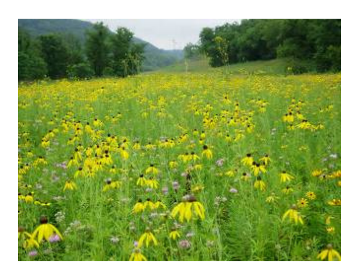
22: Echinacea (immune system booster/antihistamine)

Echinacea ( Echinacea angustifolia ) consists of three different species; the Purple Coneflower, the Pale Purple Coneflower, and the Narrow-Leaved Purple Coneflower and all three species are onsidered to be a non-specific immune system booster. Consequently, it is used similar to an antibiotic to help heal both external and internal infections. Therefore, it can be used topically as either a poultice, a tincture, or a salve to aid in healing cuts and abrasions, wounds, and burns, and can be taken internally as either a tisane (tea), a tincture (a concentrated tisane), or a dried extract to treat internal infection, colds, and flu. In fact, clinical studies have shown that ingesting this plant can significantly reduce both the severity and duration of both cold and flu symptoms. Last, it has traditionally been used as a treatment for both spider and snake bites to help alleviate the tissue and nerve damage caused by the poison that these creatures inject.