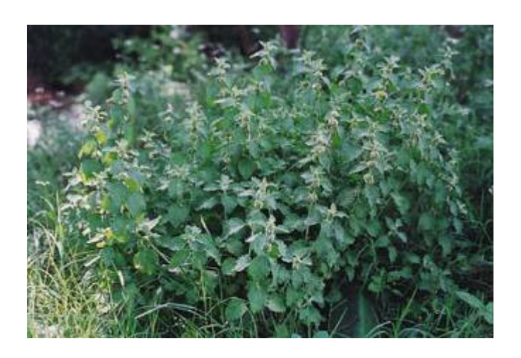
25: Horehound (cough suppressant)

Horehound ( Marrubium vulgare ) is a well known natural remedy for congestion, coughs, and sore throats because it acts as a natural expectorant and a natural cough suppressant. Also, it contains an antibacterial and an antifungal compound. Therefore, it is also used poultice for wounds as well as gall bladder disorders, jaundice, and hepatitis.